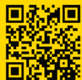
學校簡介影片 School Introduction Video