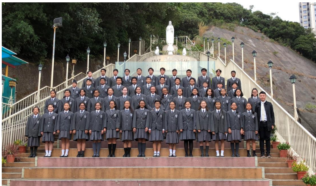
樂器班 Instrumental Class