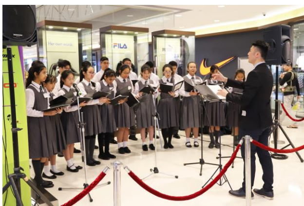
School Choir and Handbell Team at Christmas Performances