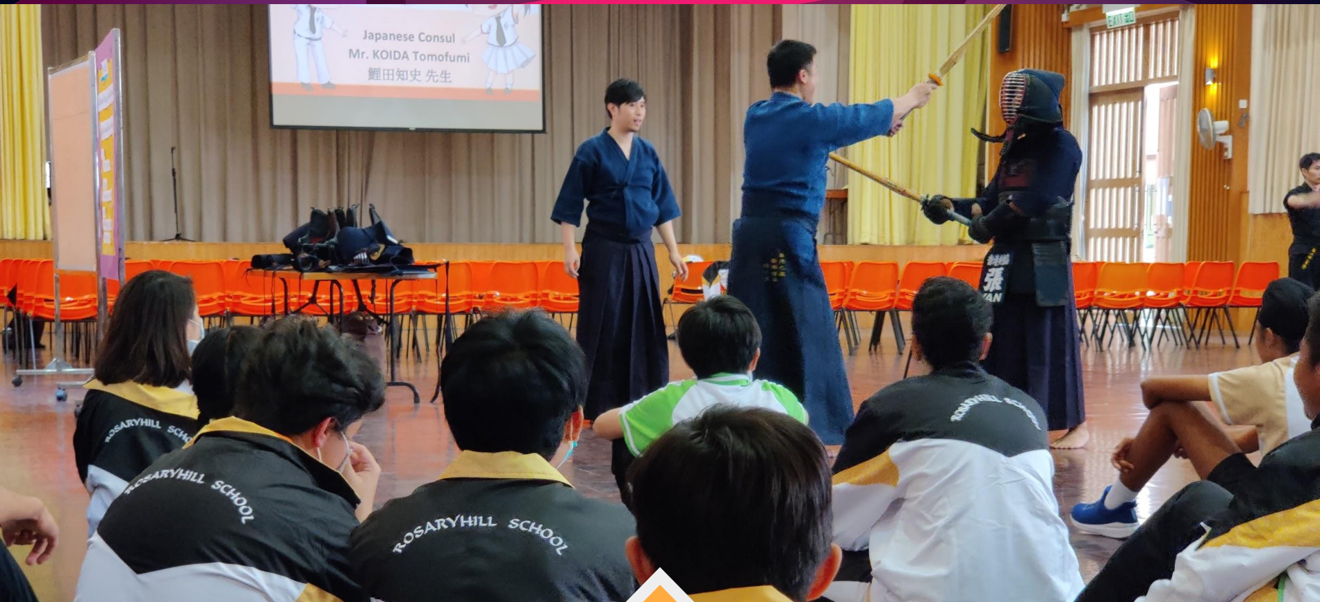
Students watching Kendo demonstration with curiosity