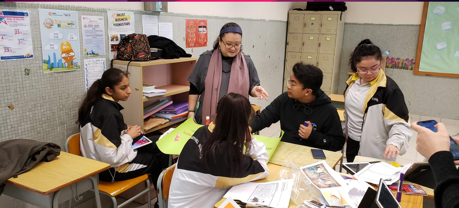
Ms So gave students tips on how to improve the board display