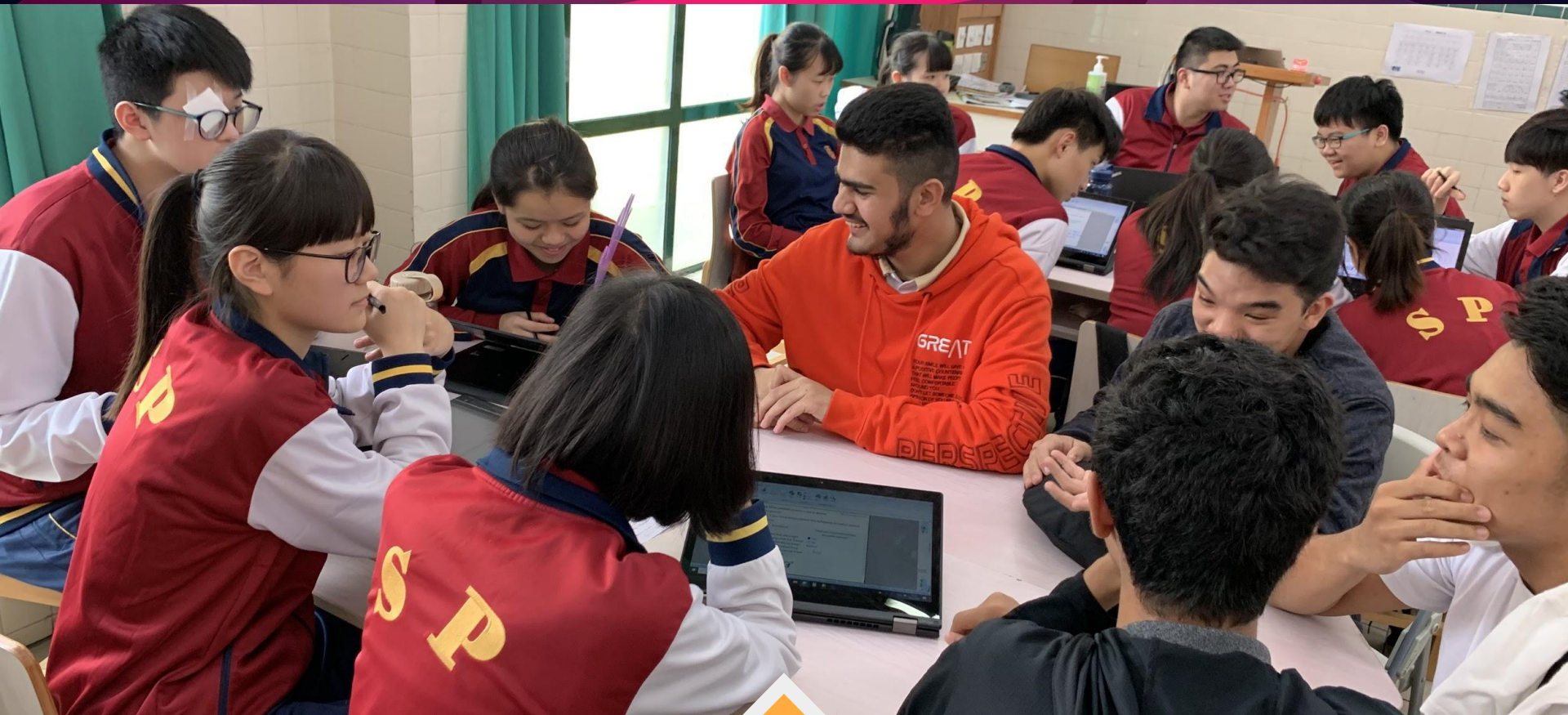
Our students having discussion with the students from Saint Paul School, Macau