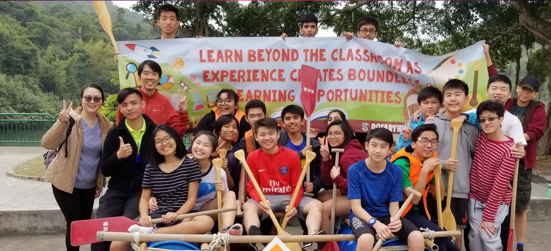
Students being inspired by the power of cooperation