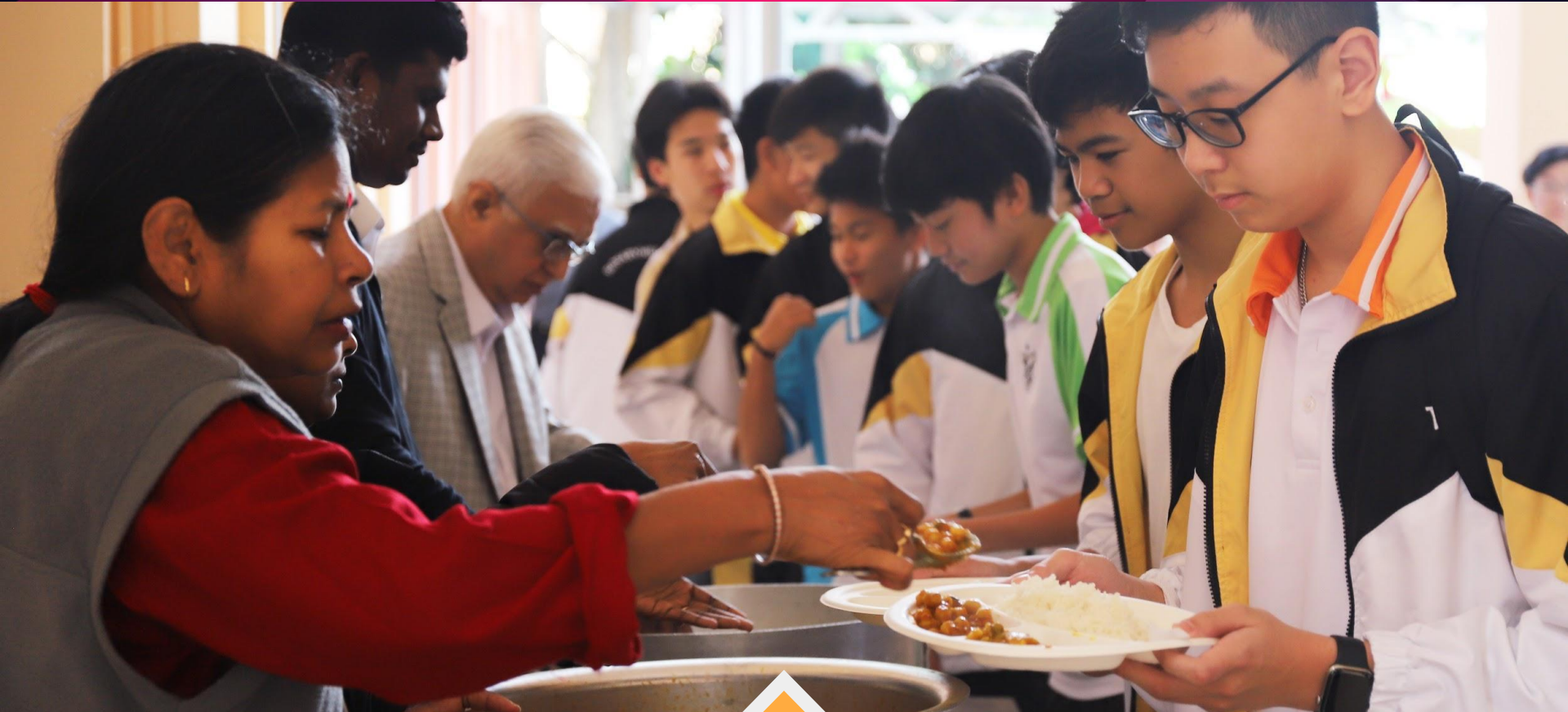
Students appreciating the provision of food by a Hindu Temple