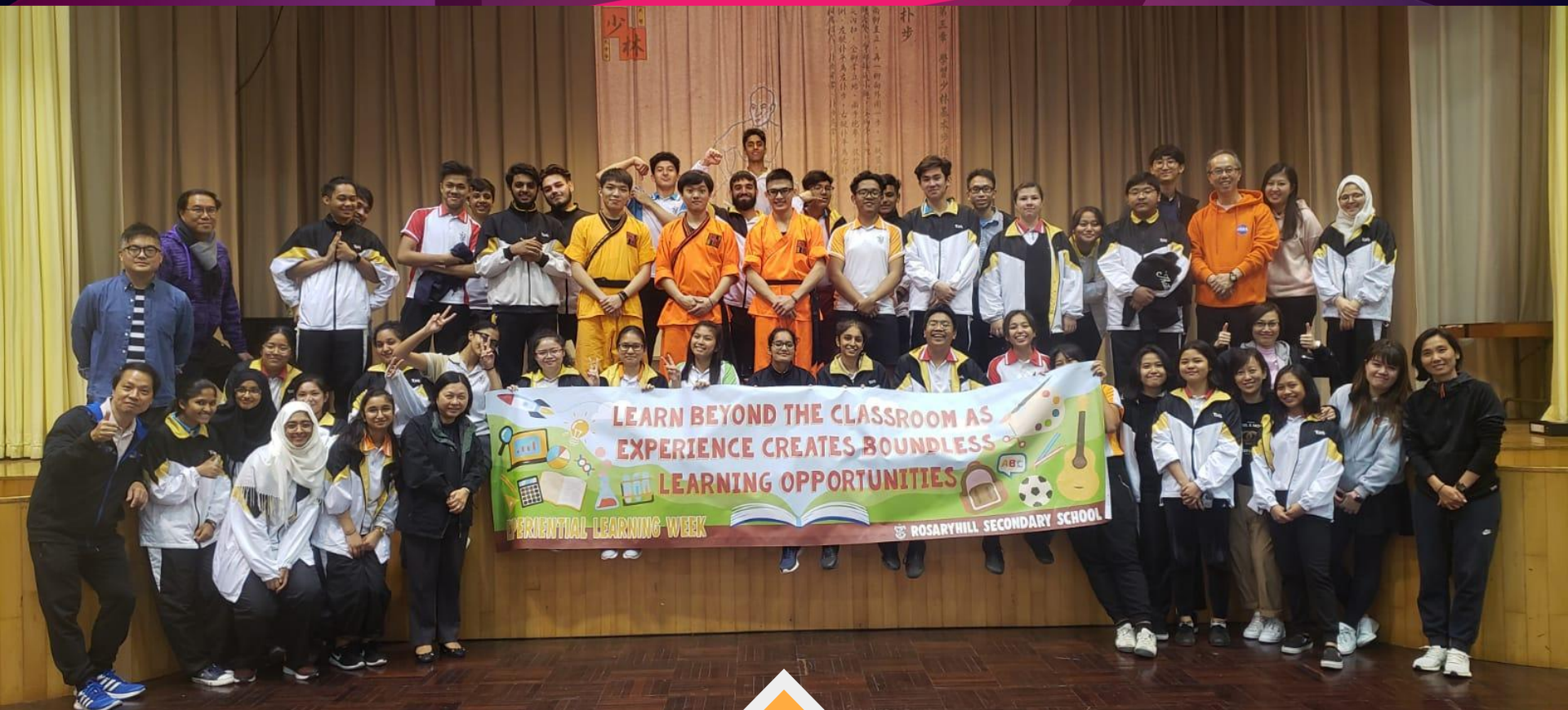
Photo with the Shaolin Kung fu masters