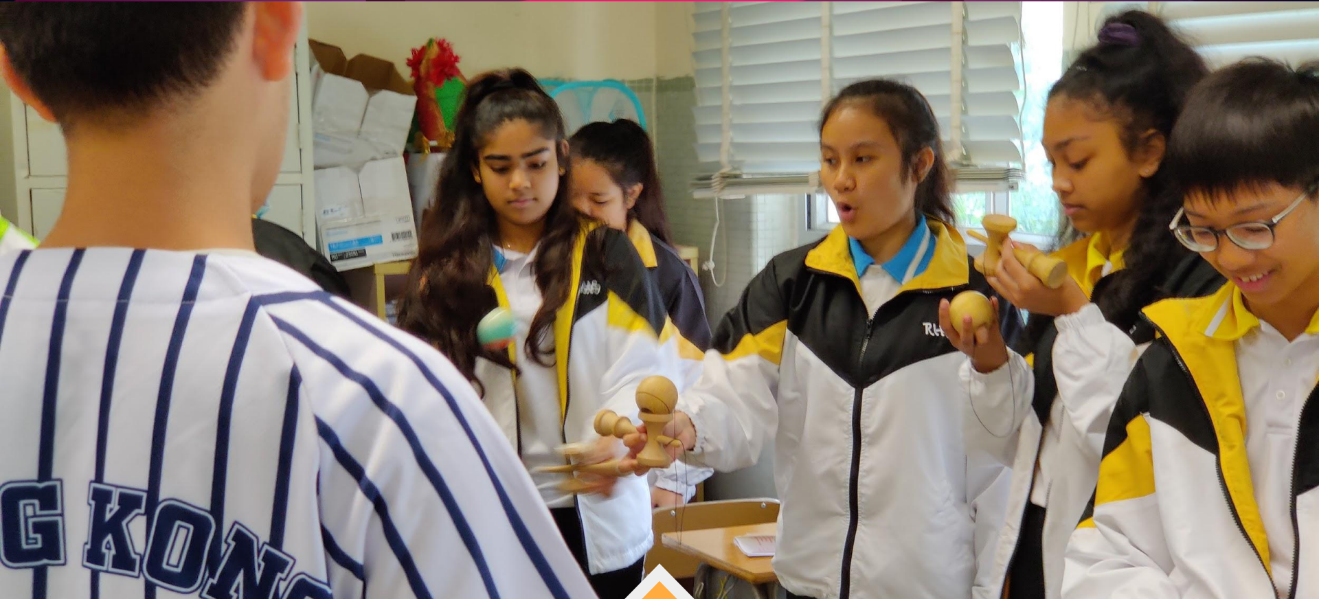
Students practising their Kendama skills