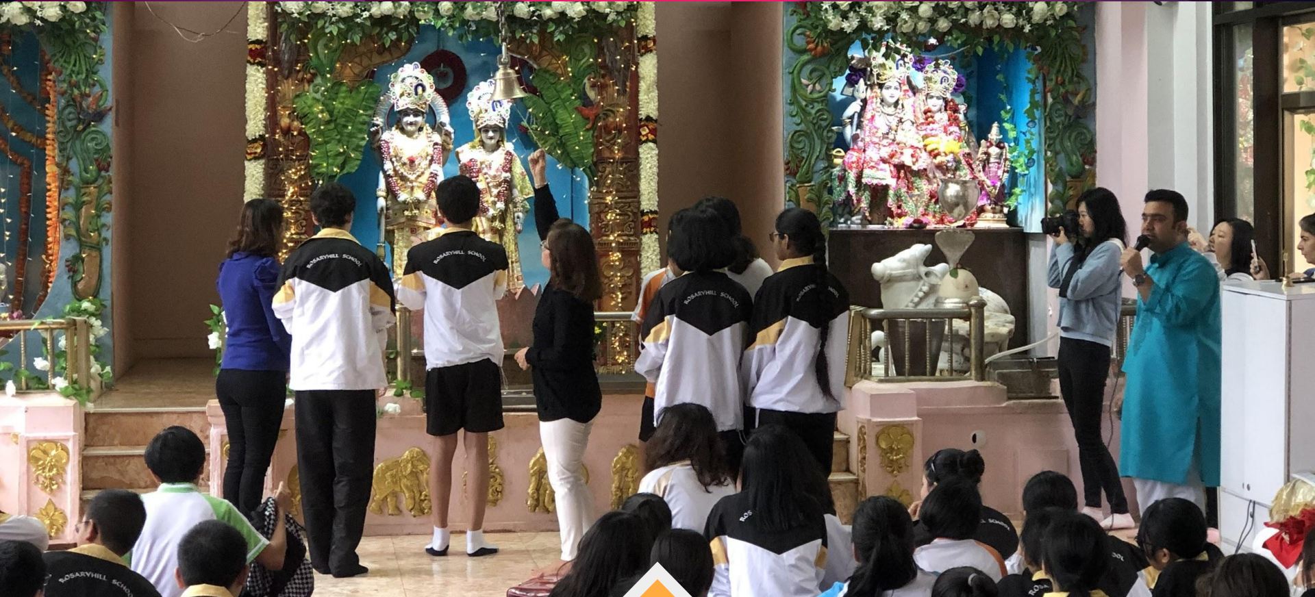
Students participating in Hindu rituals in a Hindu Temple