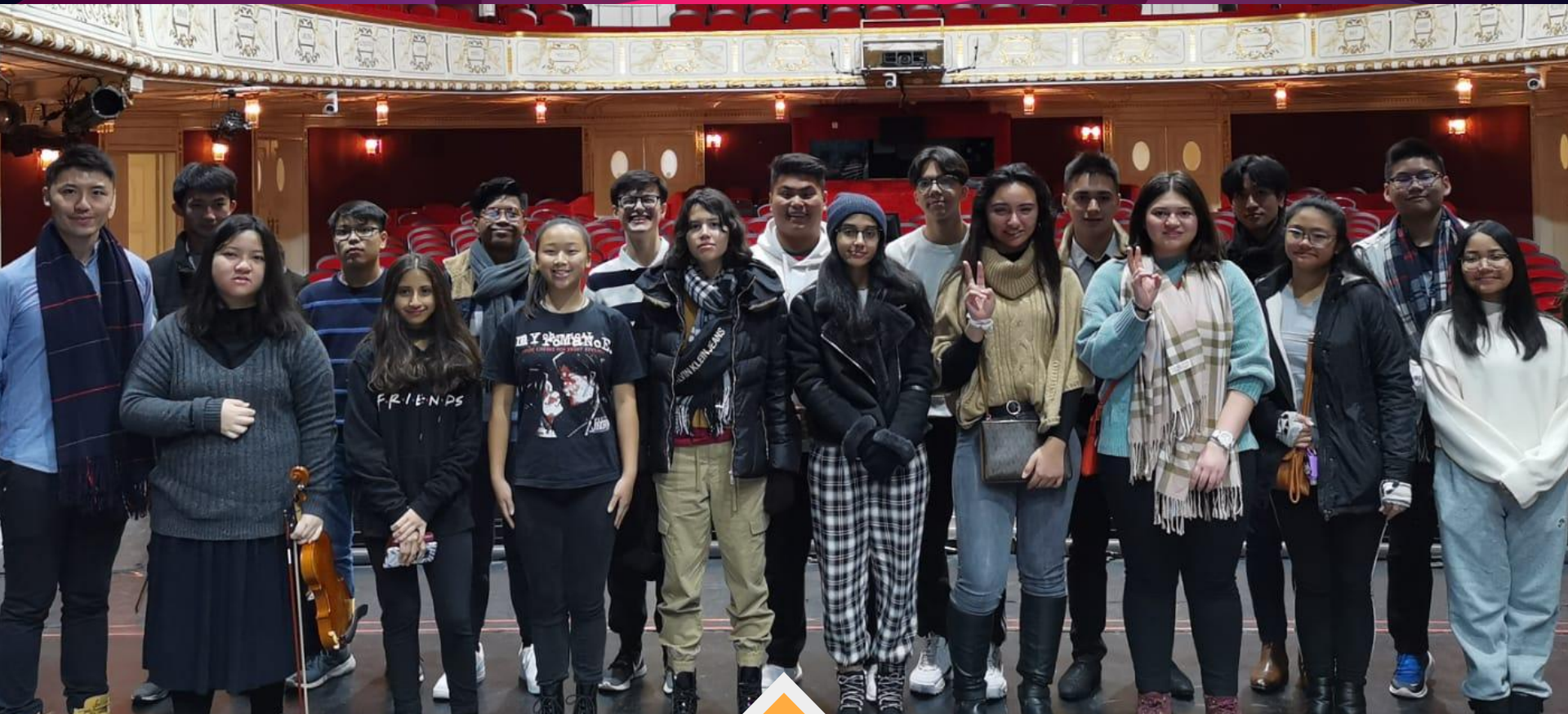
A visit to the famous Stadttheater Baden