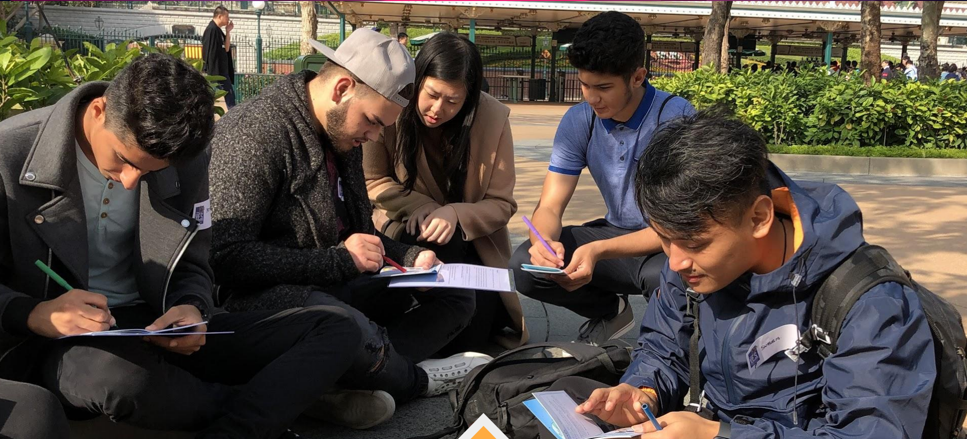
Students tackling challenges attentively