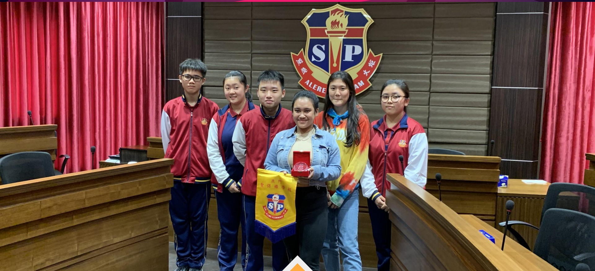
Exchanging souvenirs at Saint Paul School, Macau