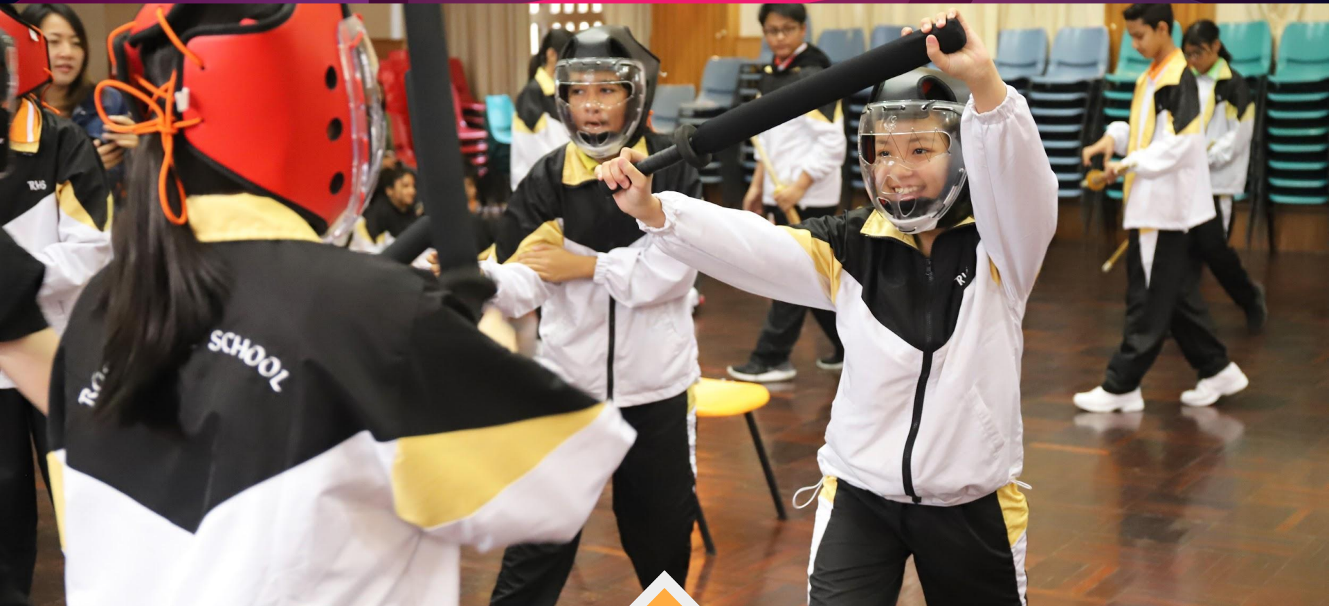
Students having fun practising sports Chanbara