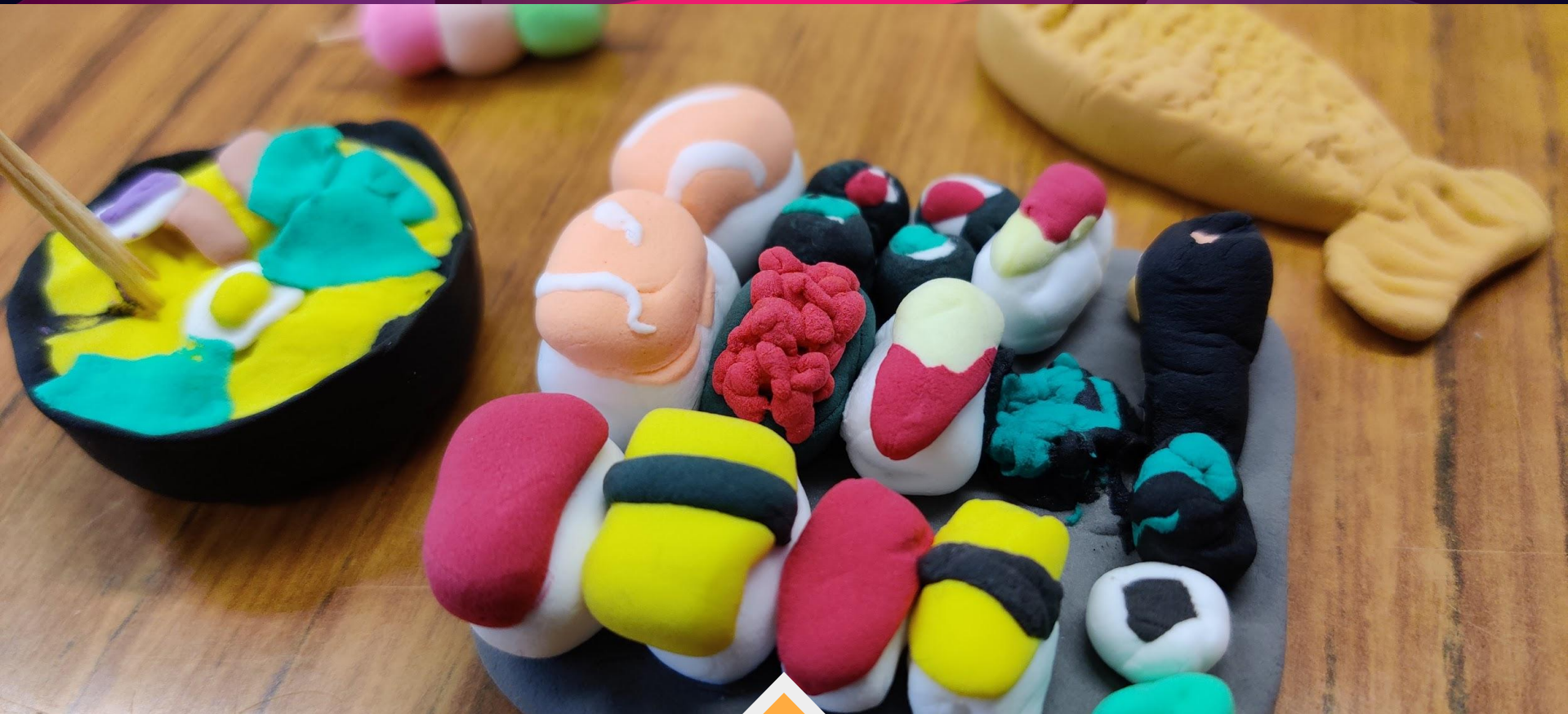
Students' real-looking light clay artefacts