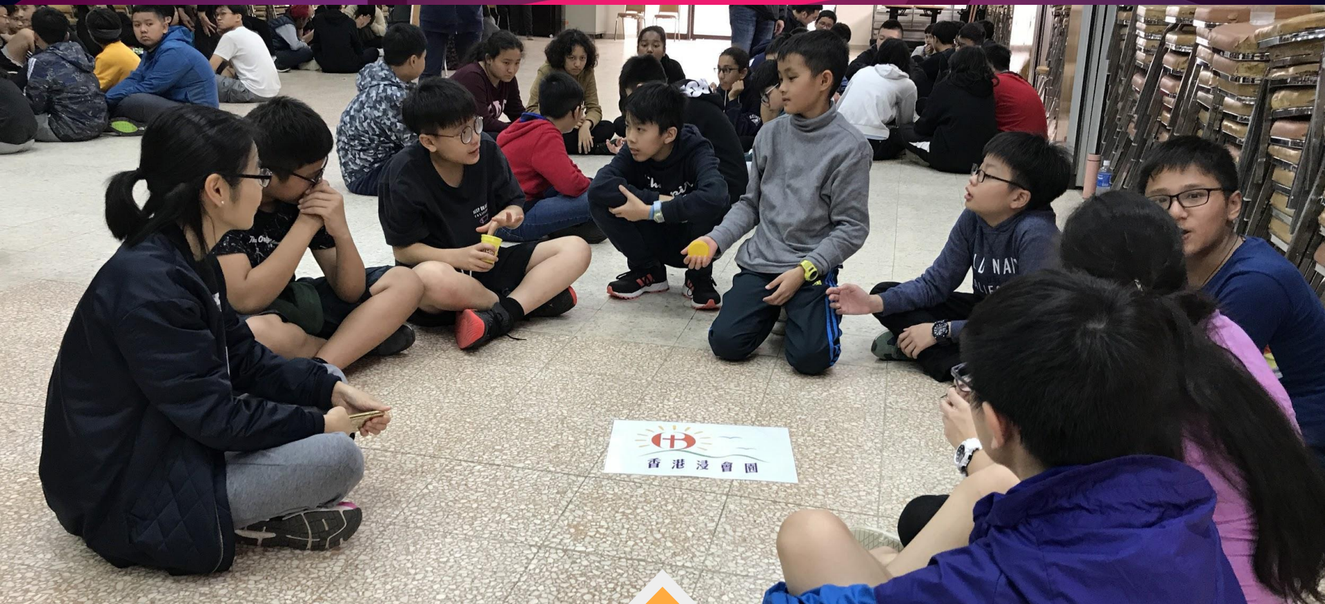
Students showing leadership skills and great teamwork in task preparation