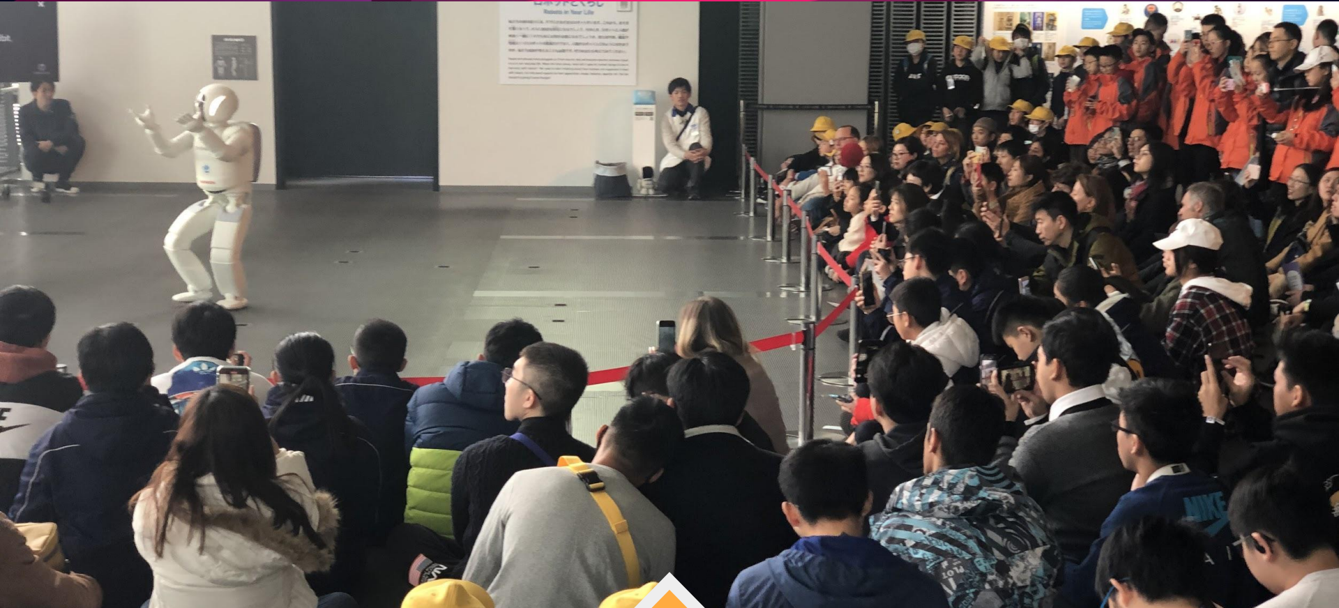
Watching a robot show in Miraikan