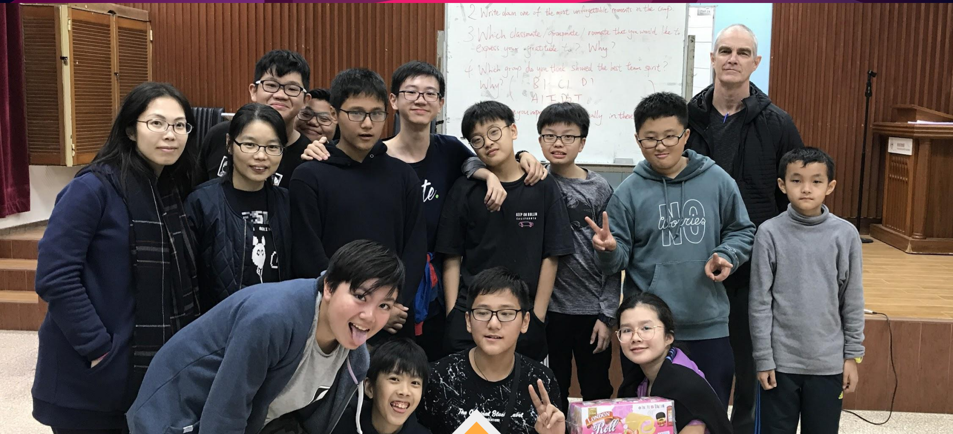
The awardees of the Best Team Spirit