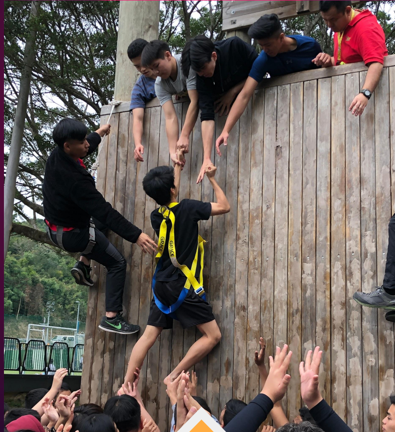
Students leaving no teammates behind in the game