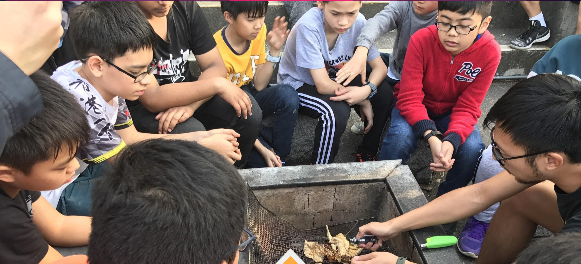
Students learning how to start a fire with limited tools