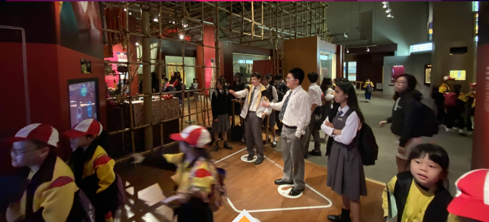
Students exploring the unique costume features in Peking Opera