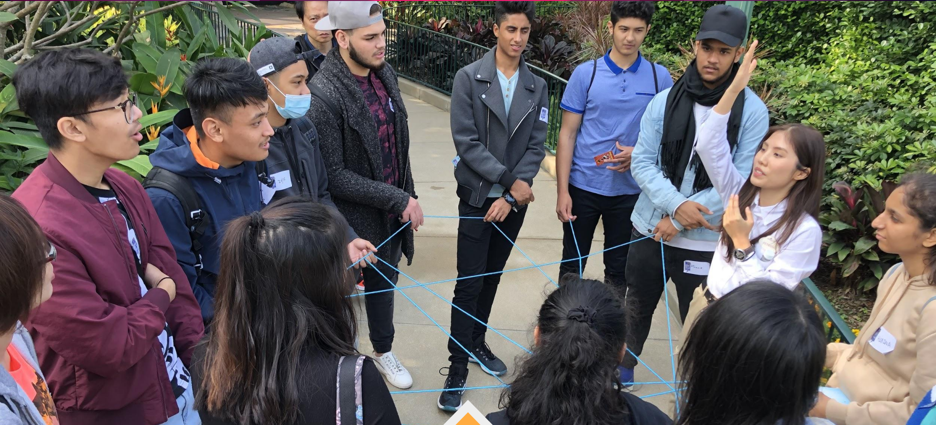
An activity demonstrating cultural assimilation