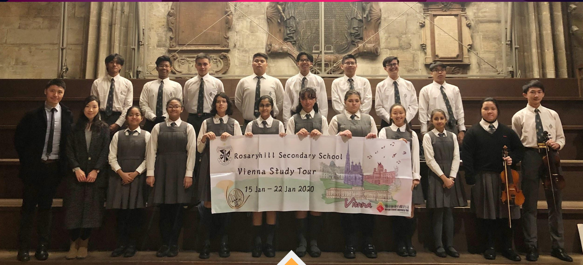
Students performing at St. Stephen's Cathedral