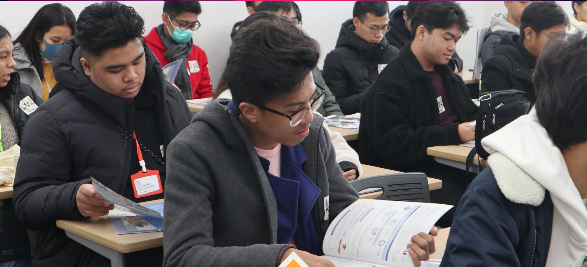
Listening to a presentation in University of Tokyo