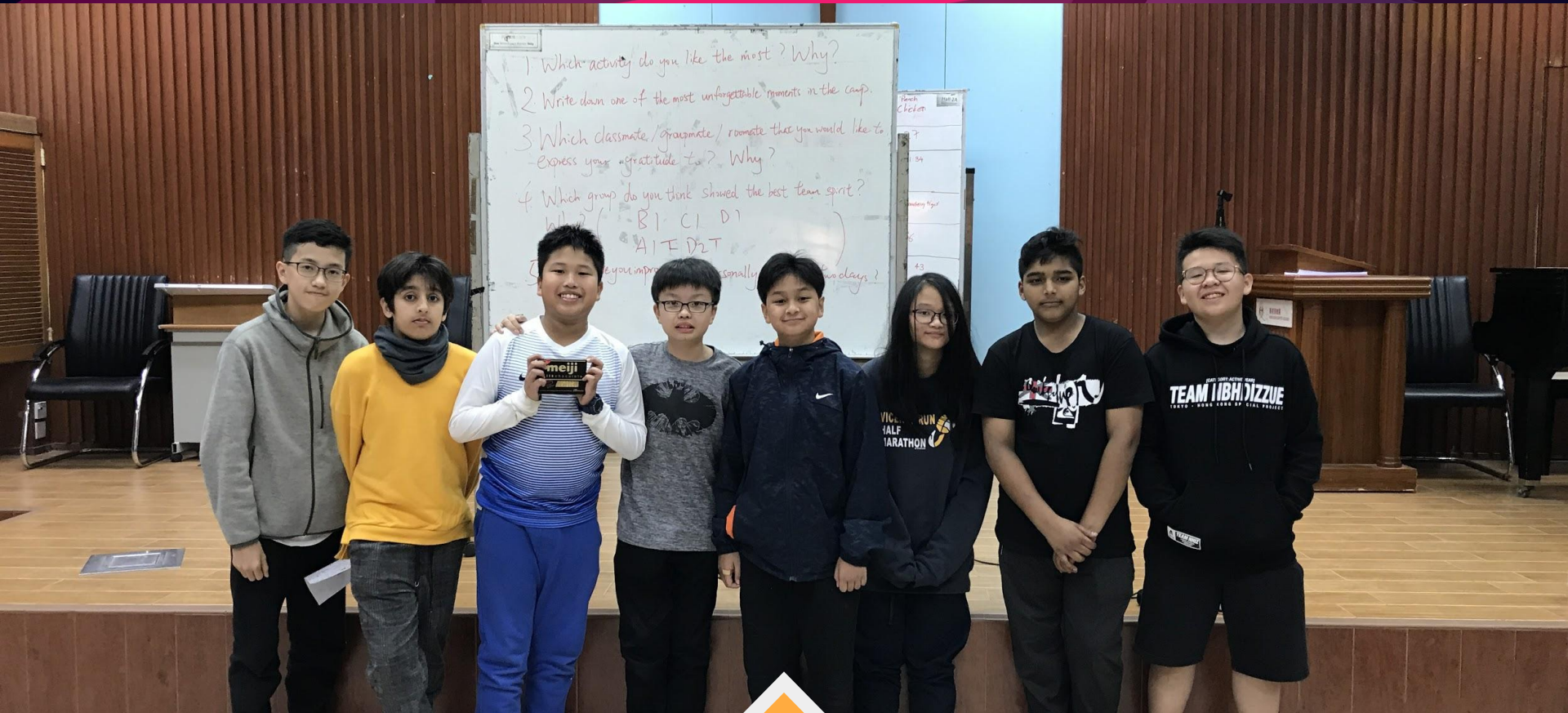
Students sharing their feelings about the camp confidently