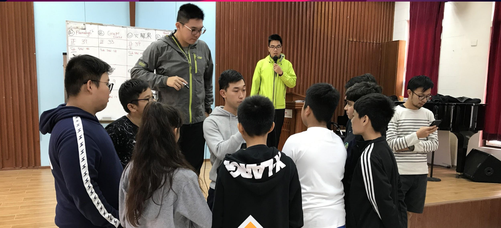
Students listening to the coaches attentively