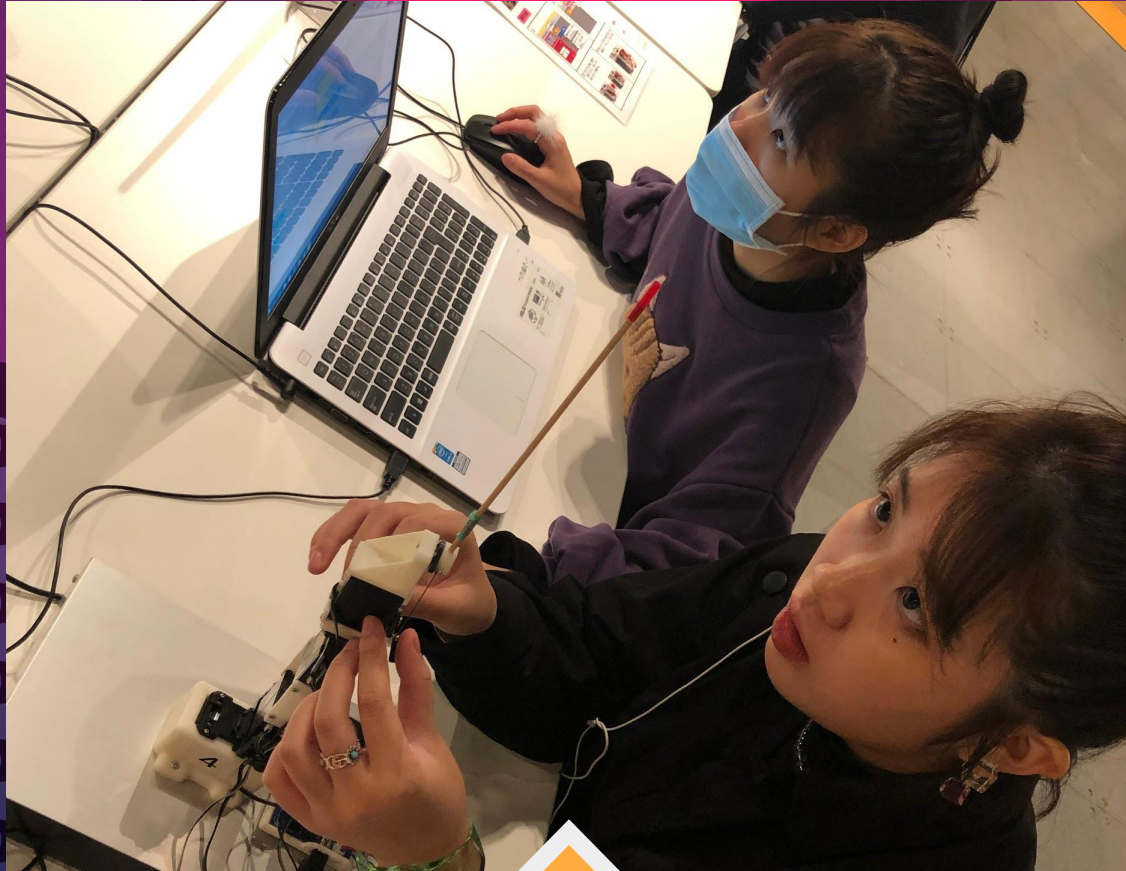
Students putting knowledge into practice