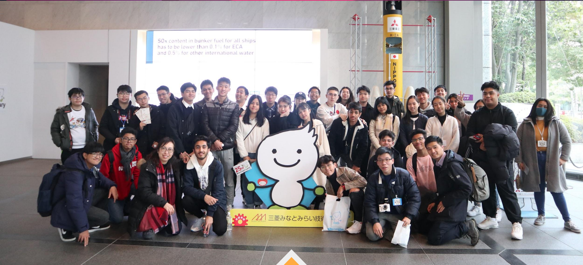
A trip to Mitsubishi Minatomirai Industrial Museum