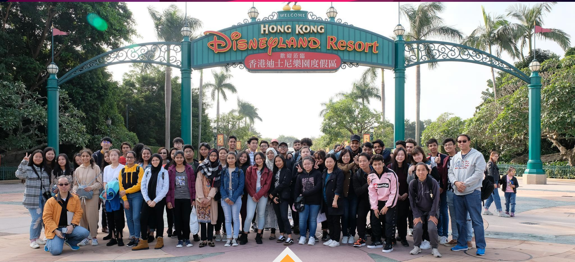
A fun day at Hong Kong Disneyland