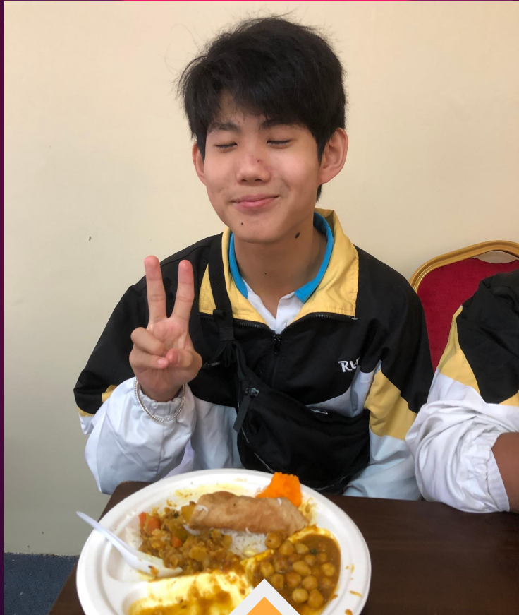
Student enjoying Hindu food like samosa and mixed vegetable curry