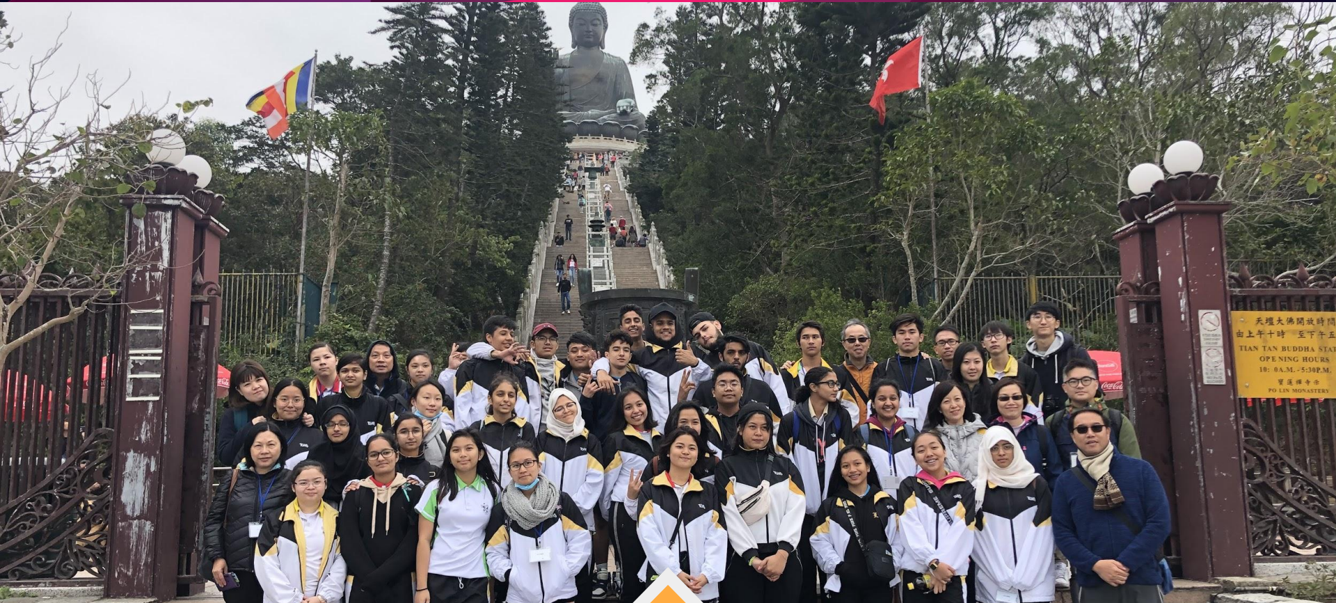
A photo at the Big Buddha