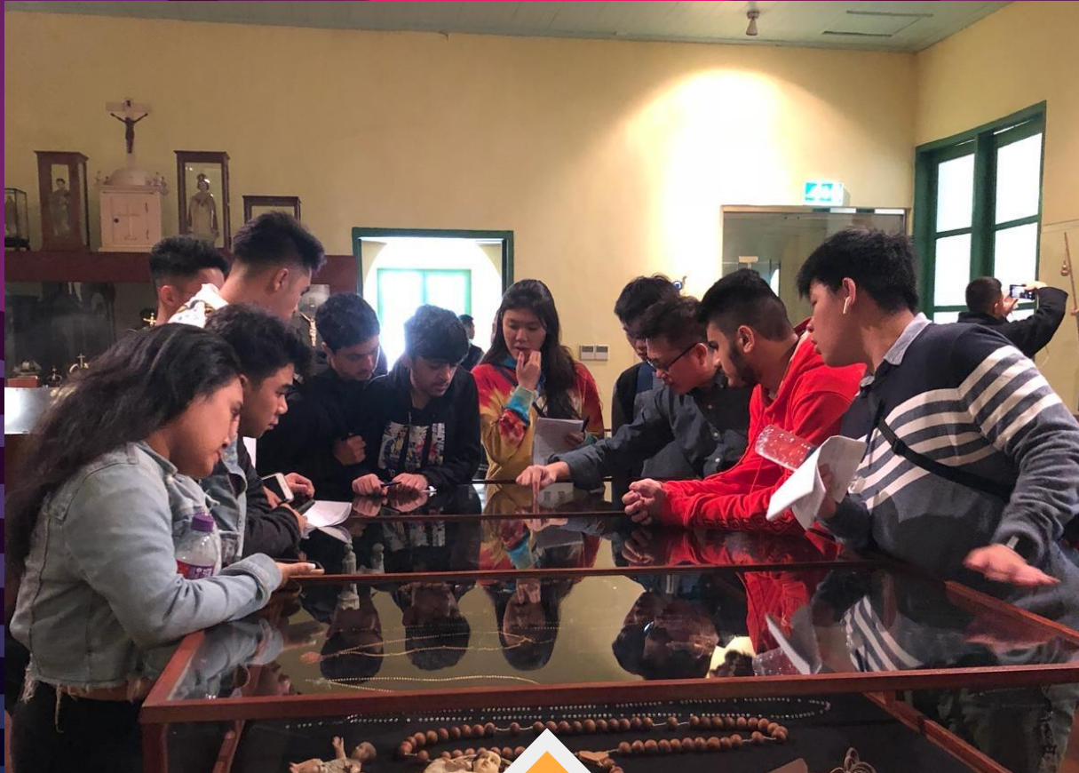
Students paying full attention to the introduction about St. Dominic's Church