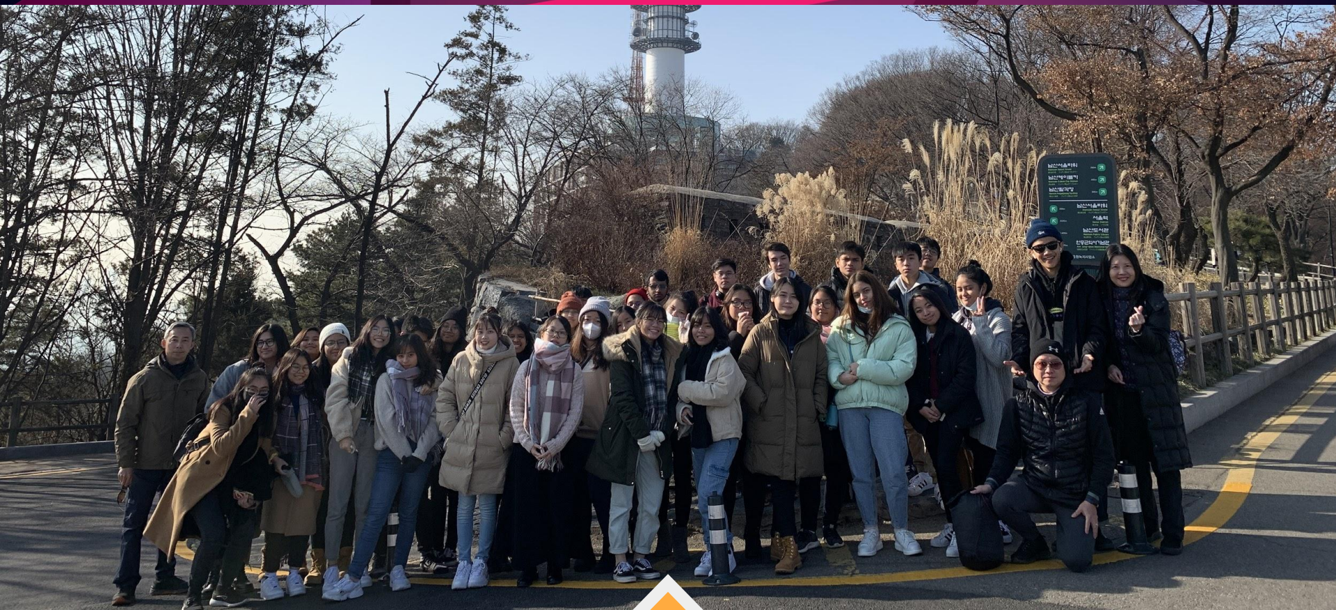
Exploring the renowned Seoul Tower