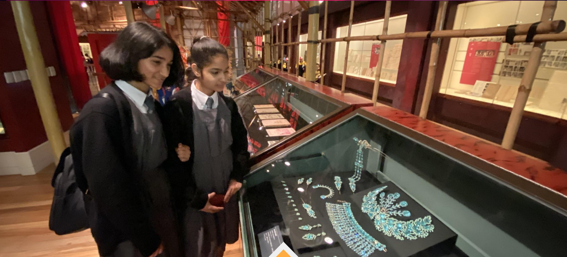
Students showing great interest in actresses' accessories worn in Peking Opera