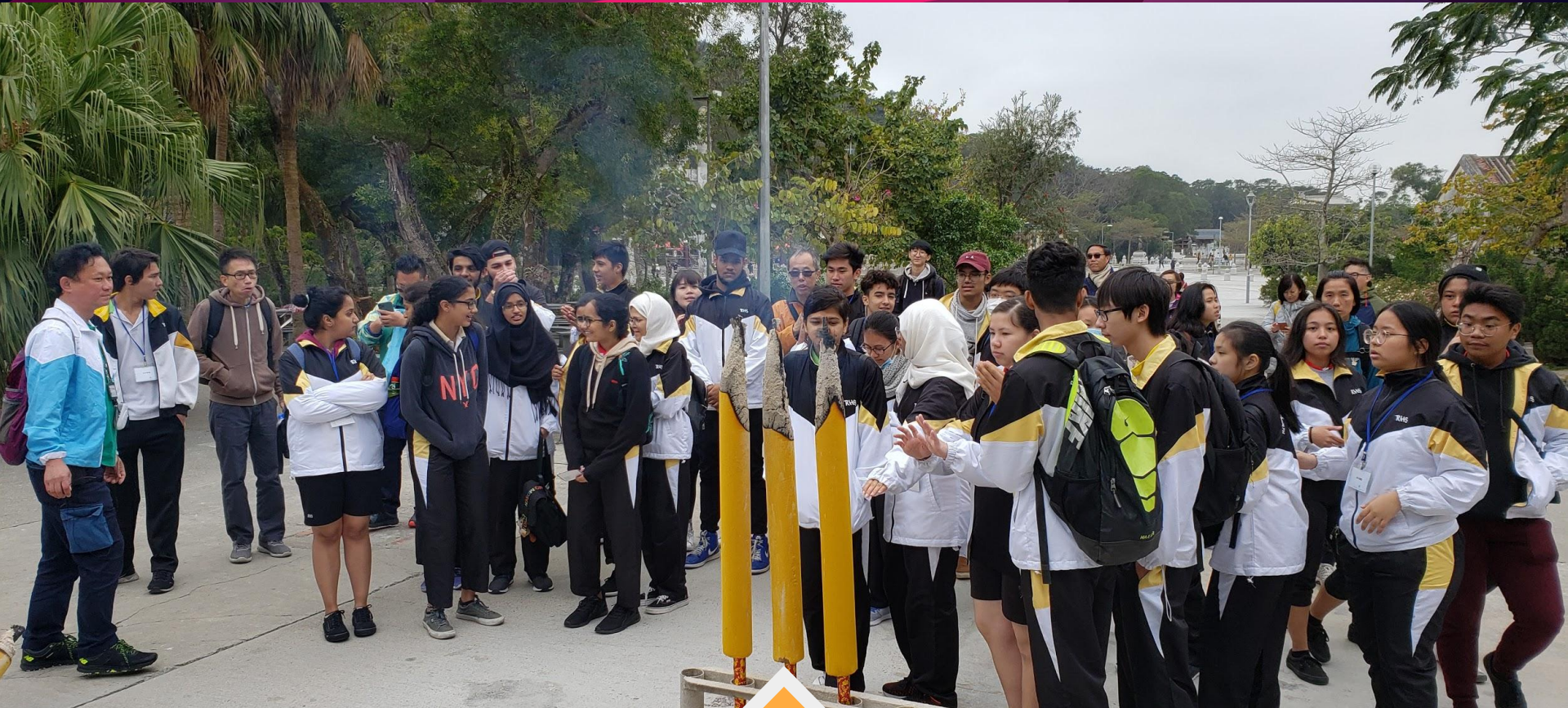
Students learnt about the meaning of the incense