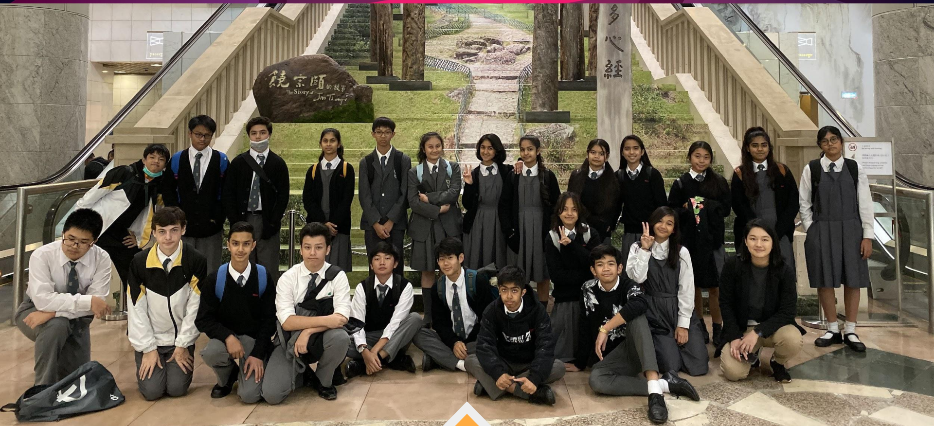
Students visiting the Hong Kong Heritage Museum