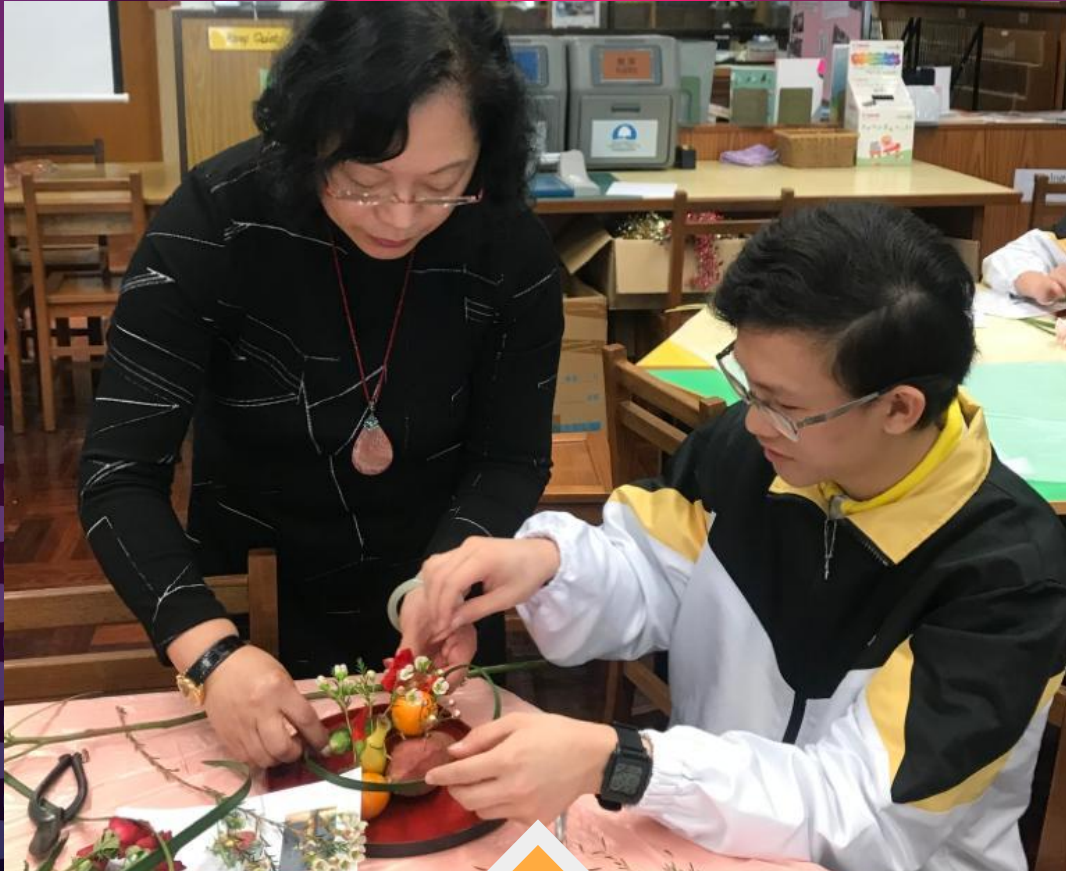
Ikebana tutor teaching a student how to arrange plants in an artistic way