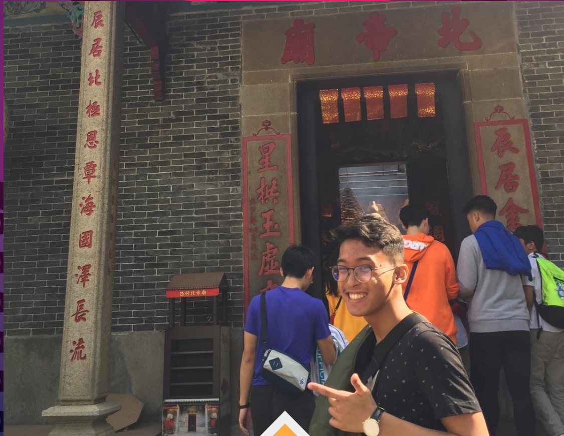
A visit to Pak Tai Temple