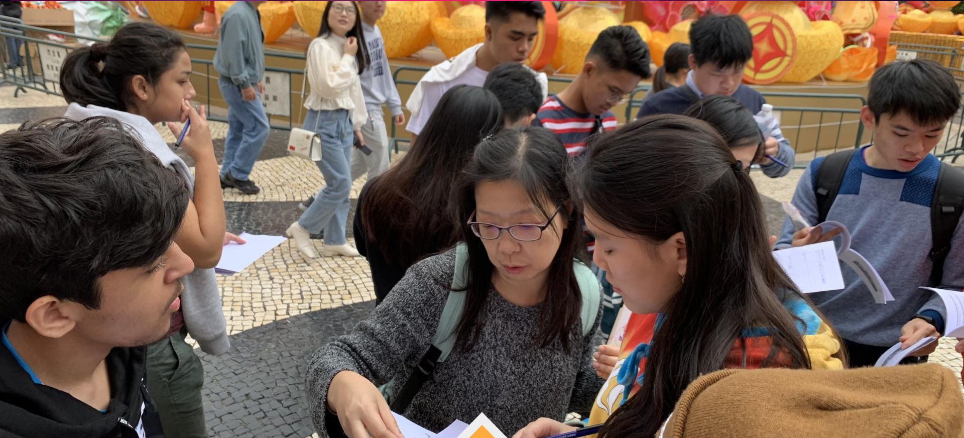
Wandering around one of the busiest streets – Senado Square