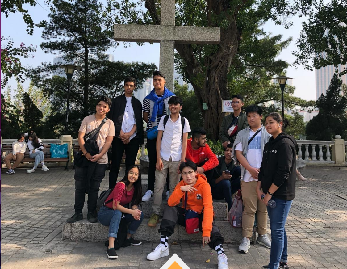
A visit to Our Lady of Carmo Church