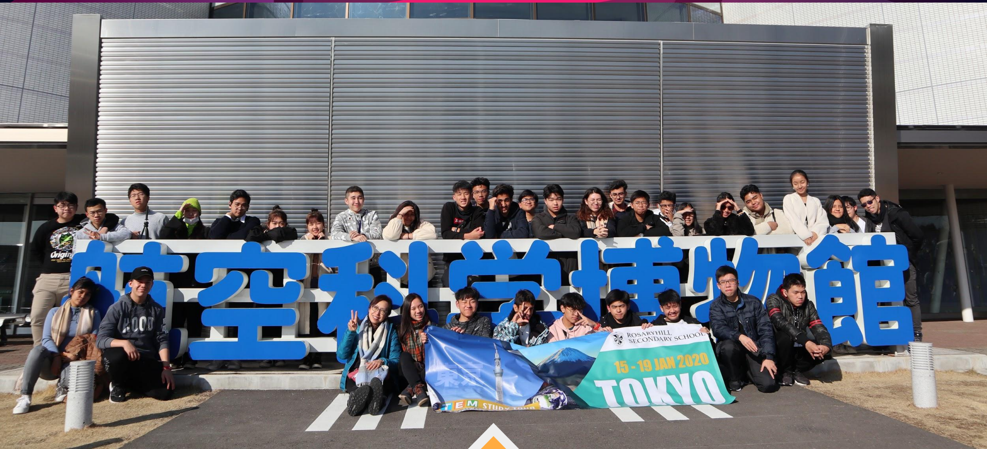
Visiting the Museum of Aeronautical Sciences in Chiba, Japan