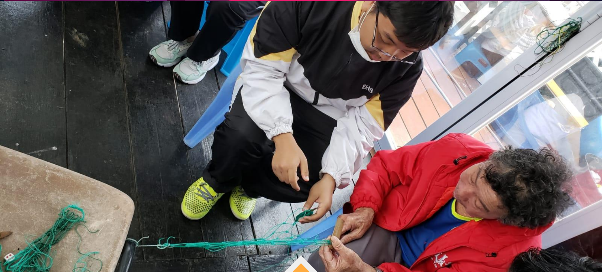
Student learnt to weave a fishing net