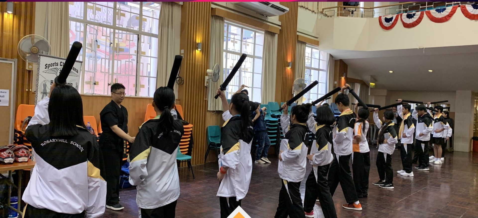
Students learning the Japanese sports Chanbara from professional tutors