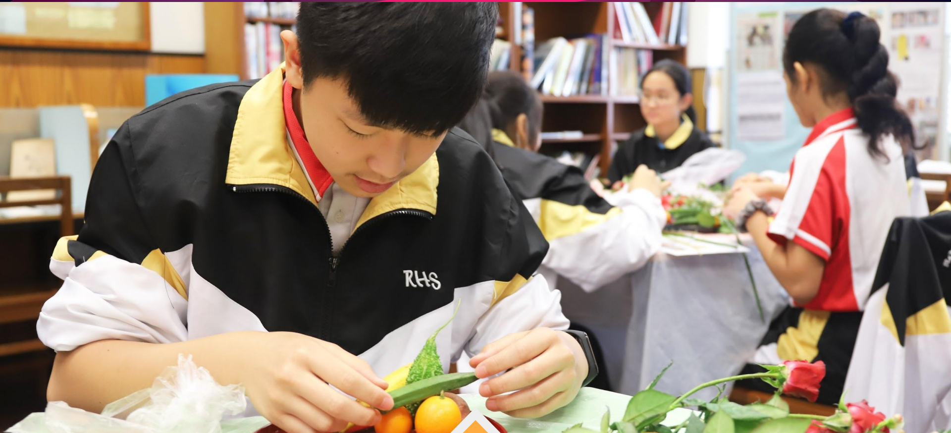
Students designing their Ikebana masterpieces with the guidance of teachers