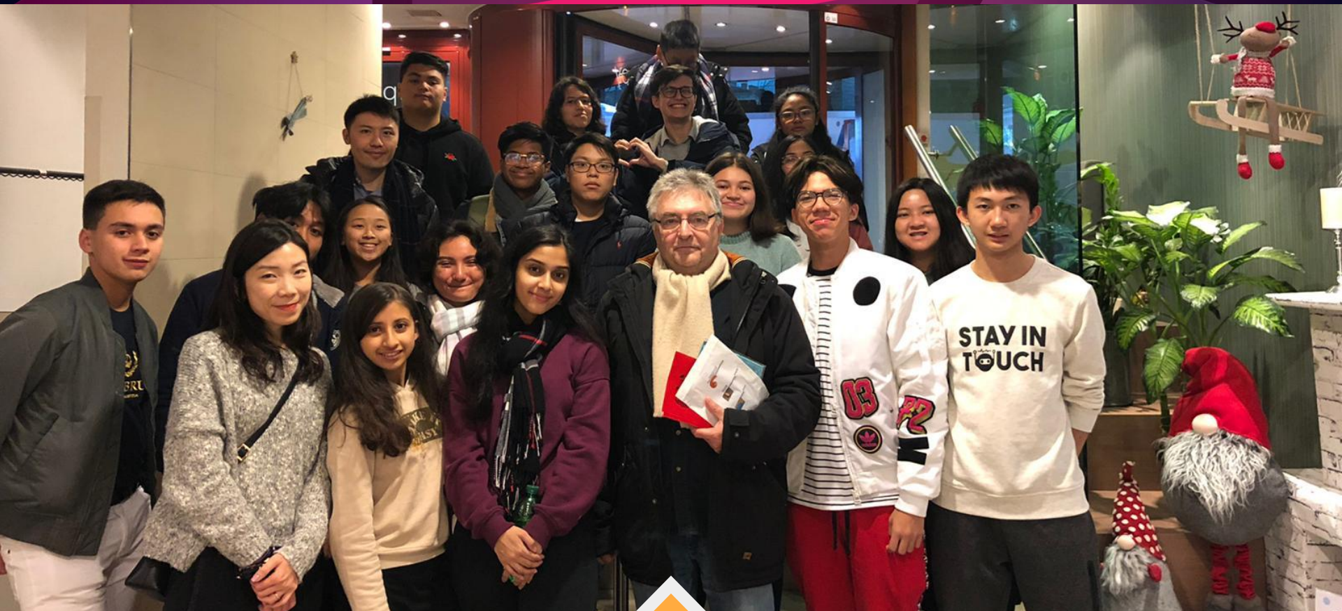
A warm welcome in Vienna, Austria