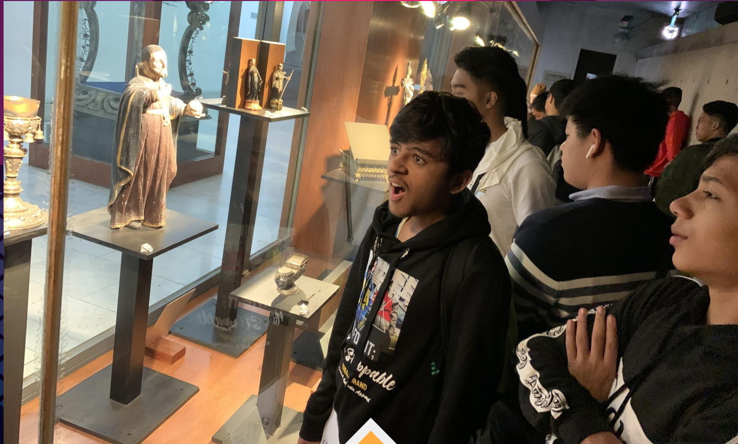
Appreciating the exhibits in St. Dominic's Church