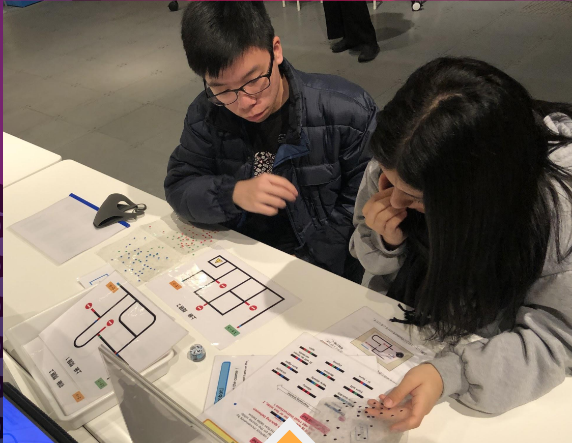
Learning in TEPIA Advanced Technology Gallery in Tokyo