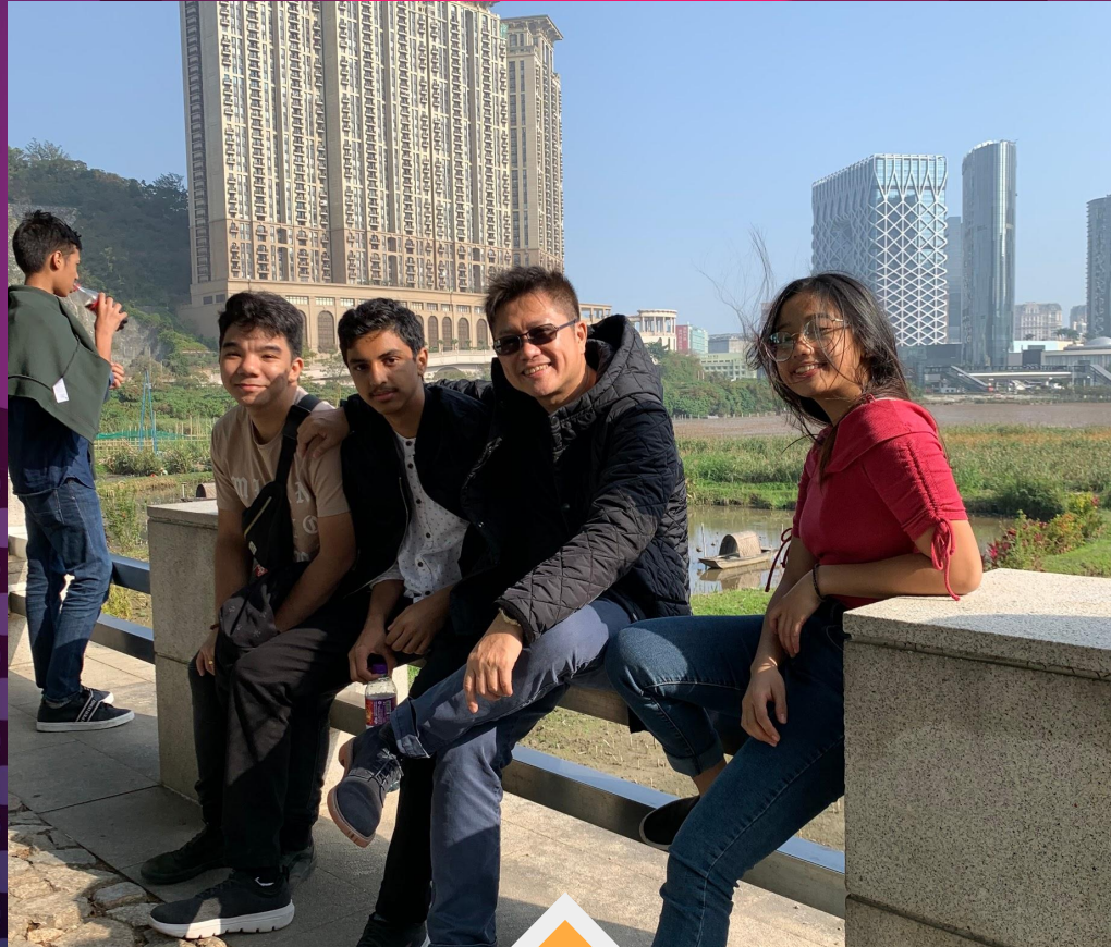
Teacher and students enjoying the view after visiting Taipa Houses Museum