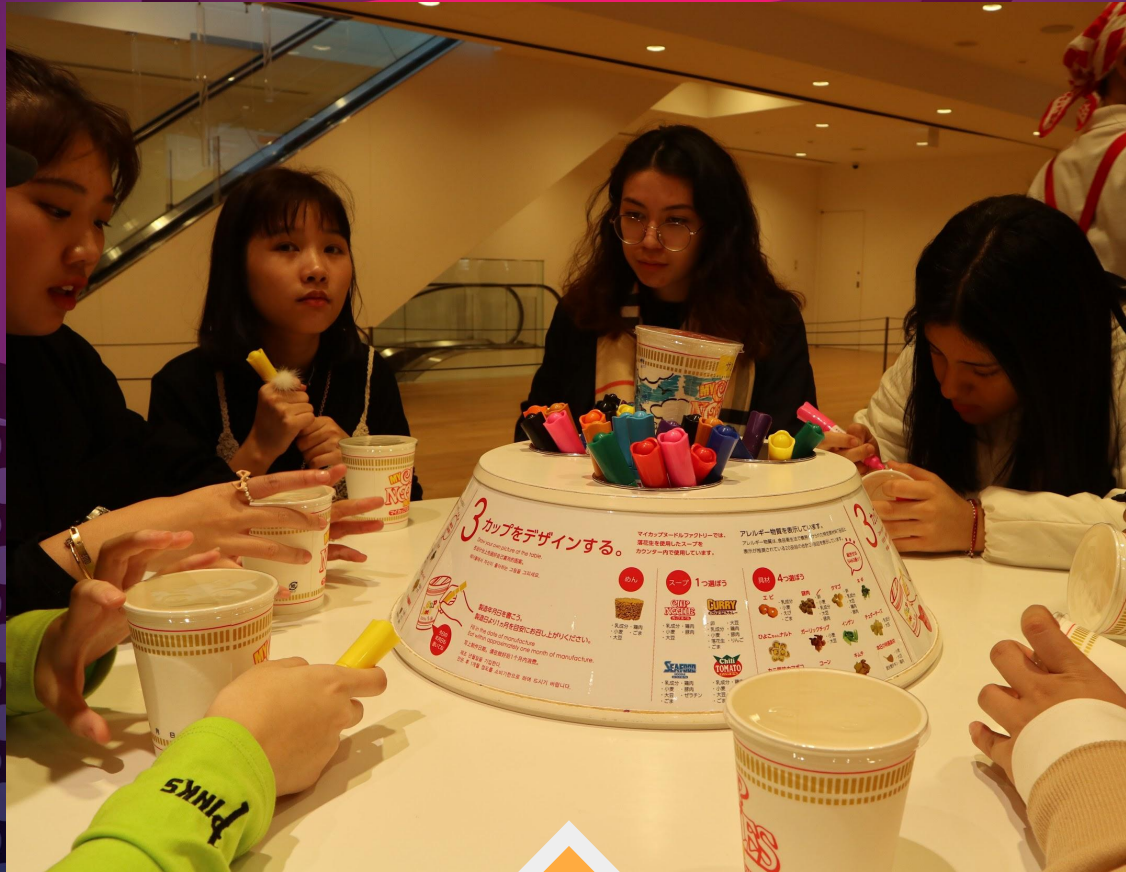
Students making their own cup noodles