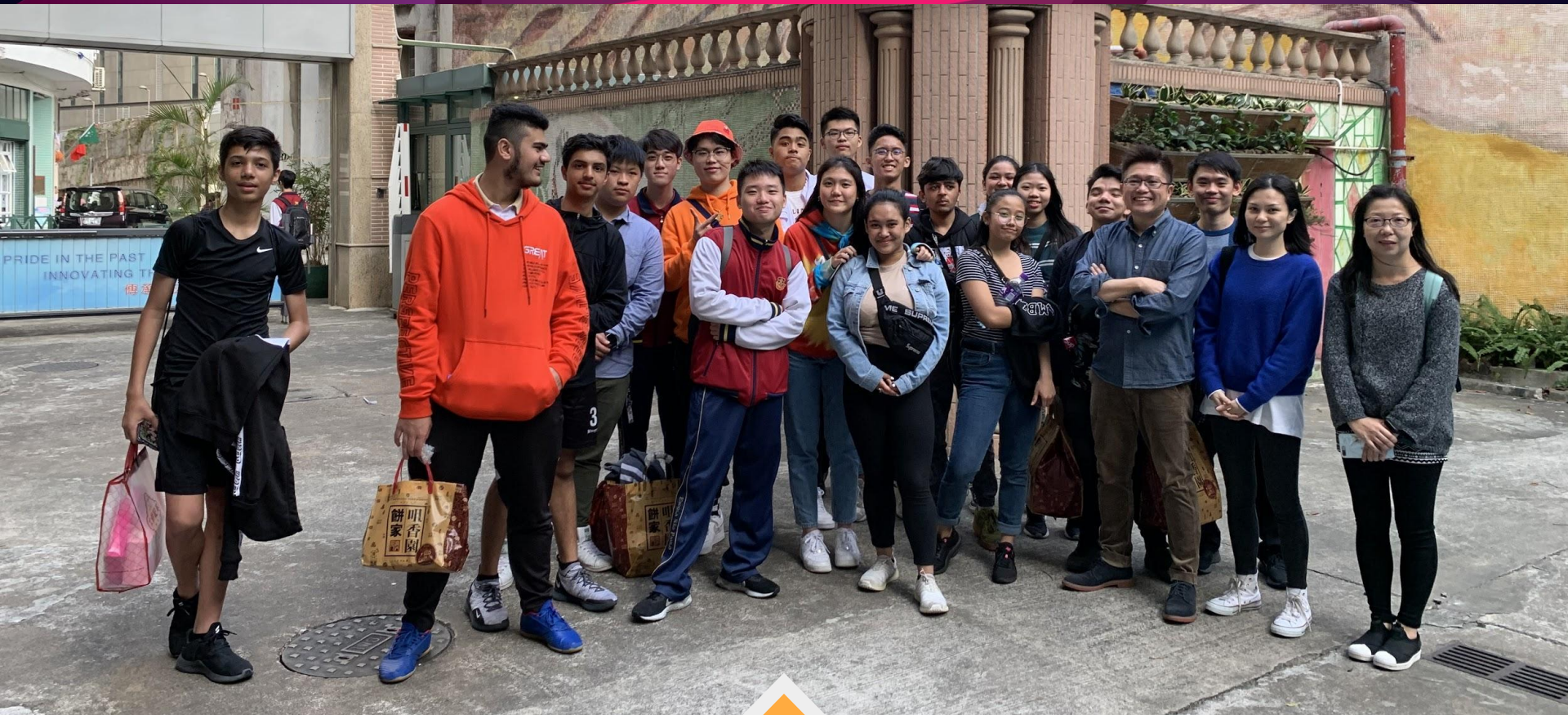
A picture at Saint Paul School, Macau