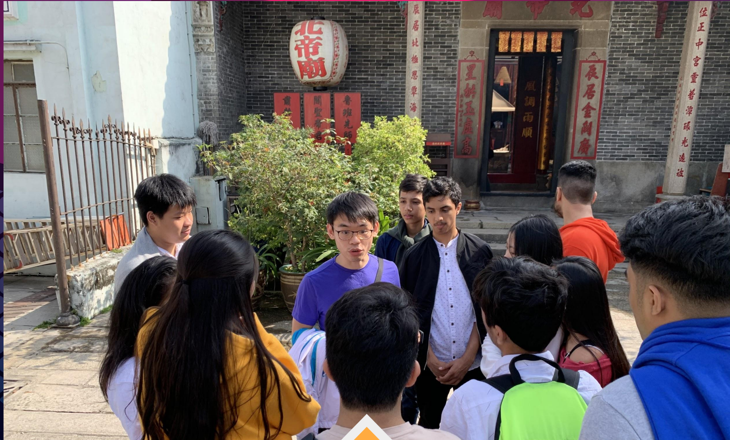
Teacher giving more information about Pak Tai Temple