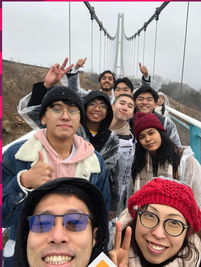
Students and teachers enjoying the skywalk journey