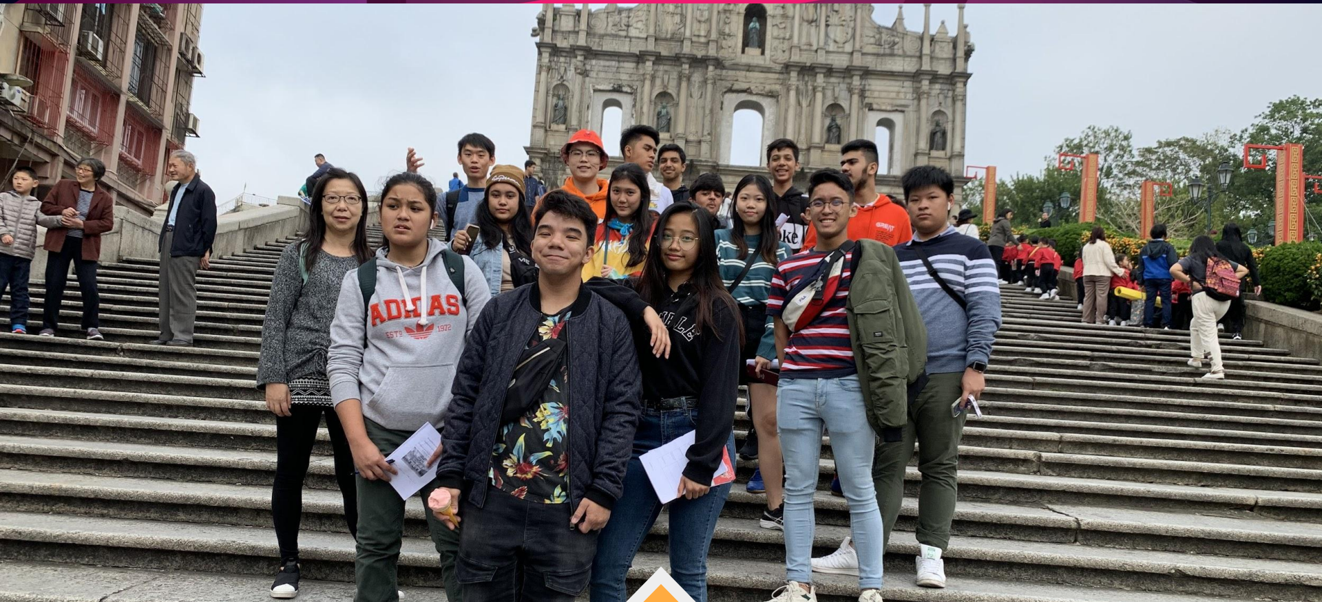
A visit to the Ruins of St. Paul's