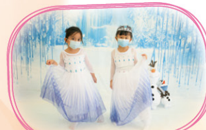
Character Play Day