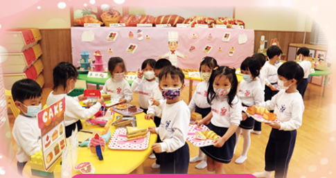
Project Bakery Shop