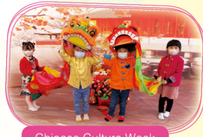
Chinese Culture Week

As the school year drew to a close, everyone had their fingers crossed and prayed for being able to hold the graduation ceremony on campus, where parents could witness the wonderful moment of their children taking such a big step forward in their academic lives – and God heard our prayers. We were indeed able to hold graduation in our school hall. Although, instead of one big ceremony with all the Upper classes, we divided into three sessions with two Upper classes in each session. Despite these changes, we created many touching moments that undoubtedly left all our graduates full of unforgettable memories.