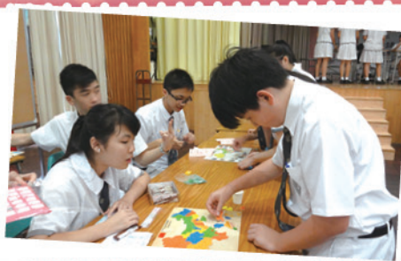
Chinese Language Carnival