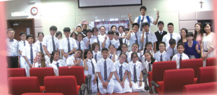
Putonghua Choral Speaking Competition