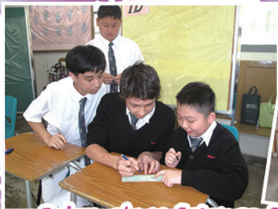
Inter-class Science Spelling Competition